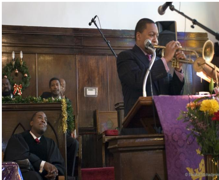
Wynton Marsalis Men's Day 2007